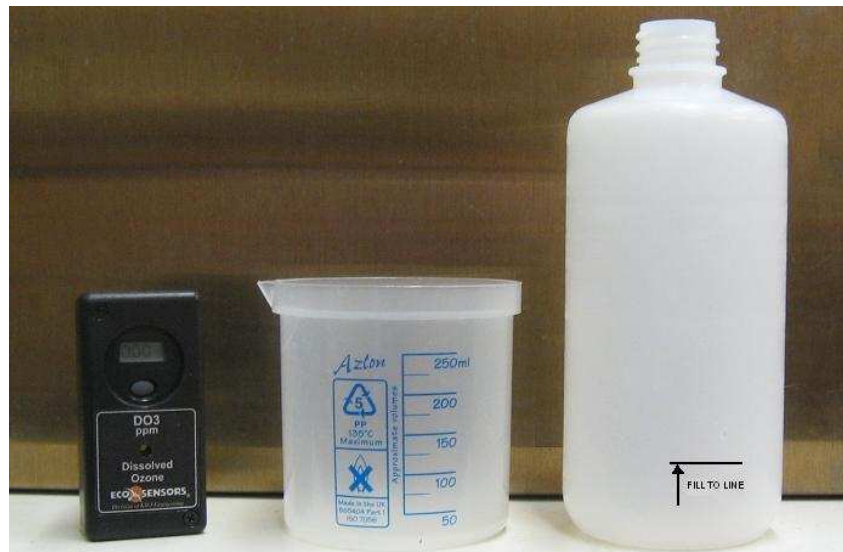
Figure 2: DO3 with 250 ml Beaker and Sample Bottle (provided)