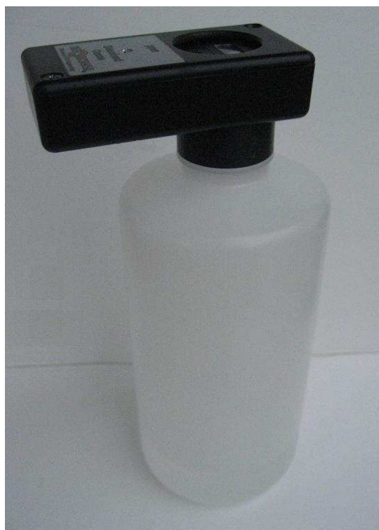
Figure 4: DO3 on sample bottle for measurement.